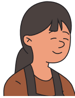
Soo - 8