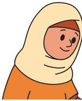
Reese - 20